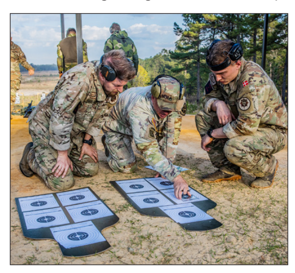
After the "Move to Cover" event on 8 April, an ISC staff member checks the targets of Team 35 from Denmark.

During the fourth day of the International Sniper Competition (ISC), Team 26 from the 3rd Infantry Division completes the "Hold the Line" event at Burroughs Range on Fort Moore, GA.