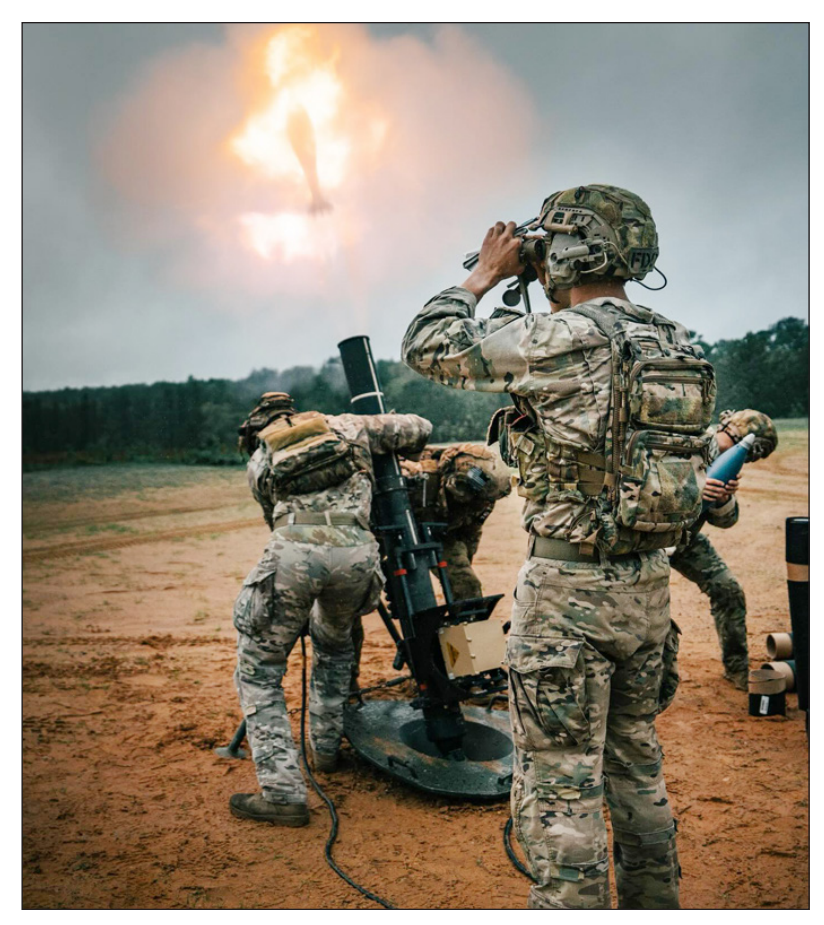
Team 16 completes the 120mm live-fire event on 11 April.