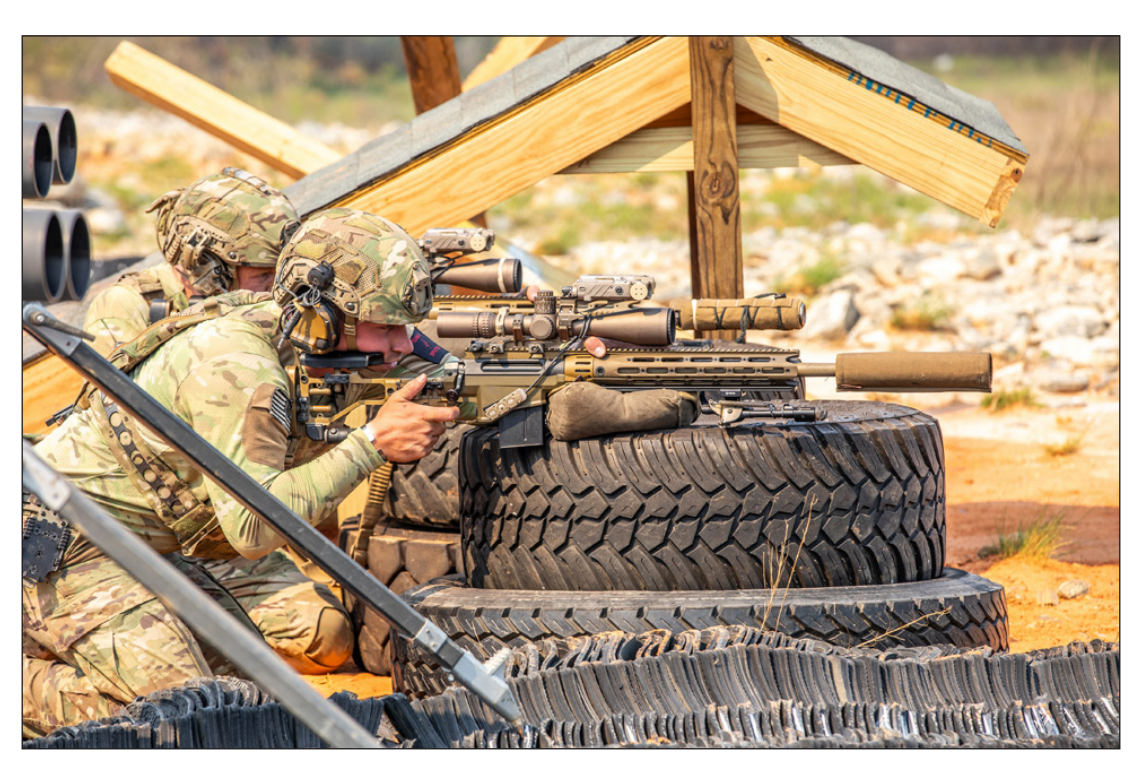
A sniper team engages targets on Day 2 of the ISC.