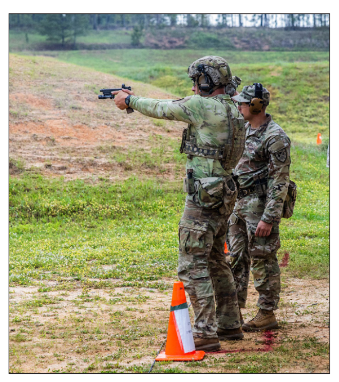
A competitor takes aim during ISC's "Two Gun Pistol" event at Krilling Range on 9 April.