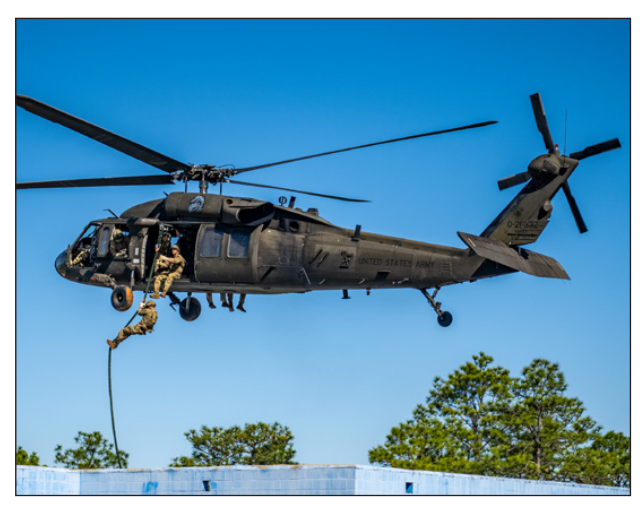
A team fast ropes from a UH-60 Black Hawk helicopter during an urban operations event on Day 1 of the Best Ranger Competition.