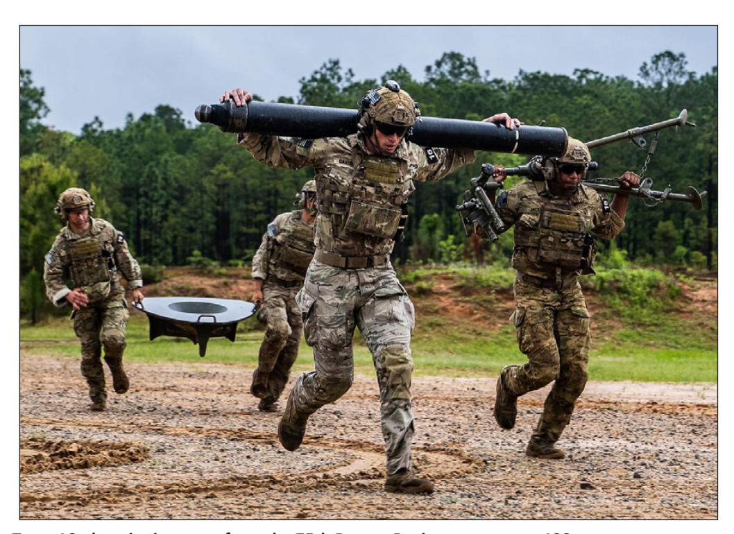
Team 16, the winning team from the 75th Ranger Regiment, moves a 120mm mortar system during the final day of the competition.